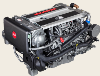
YANMAR 8LV 370 HP